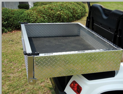
Heavy-duty recycled tire insert