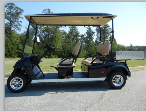
Also available as 2 or 4 passenger