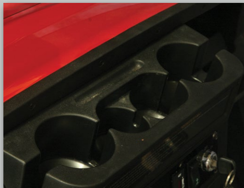
Four front cup holders