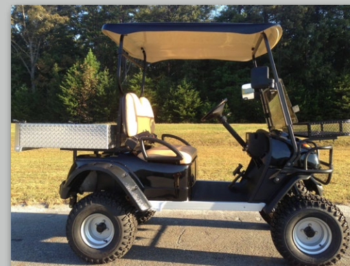
Also available as lifted model (STAR Sport)